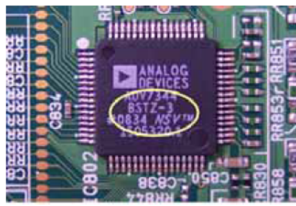
Correct ("BSTZ-3" is printed)