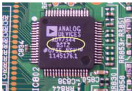
Incorrect ("BSTZ" is printed)