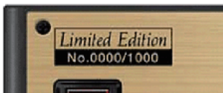
Product Model(Printed Serial No.)