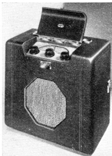
This compact receiver is made by Roberts Radio, of Creek Road, East Molesey, Surrey (Phone: Molesey 2684), and priced at £21 0s. 6d.

E MPLYING an effective superhet circuit, this all-dry portable four-valve switches easily at will over the long, medium and short wave ranges.