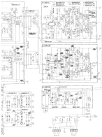
Figure 10.1: Internal architecture of a microcontroller unit (MCU).