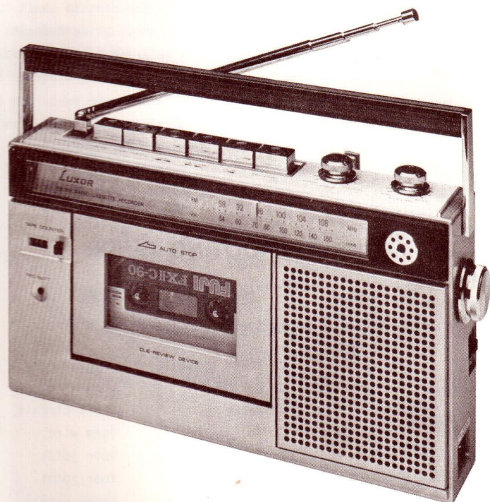
TYPE 110 9114